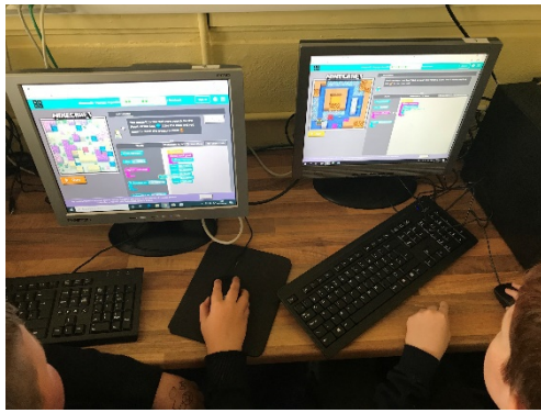
Paistí ag foghlaim scileanna códála ar scoil/Children learning Coding Skills at school

This month we are focusing on Fire Safety and Online Behaviour as part of our Social, Personal and Health Education.